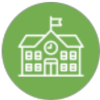
School Program Fees