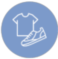
Clothing & Shoes

School personnel apply to the Foundation on behalf of students experiencing high levels of financial need..